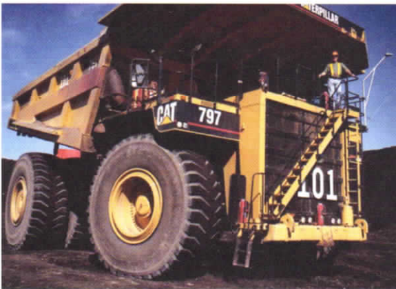
Figure 2: Image courtesy of Syncrude Canada Ltd.